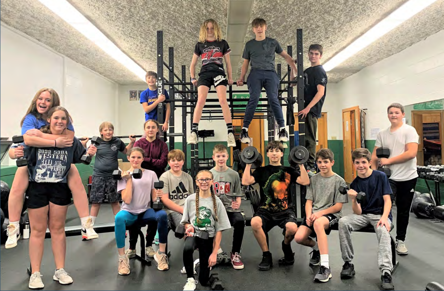
East Middle School Weight Training Crew