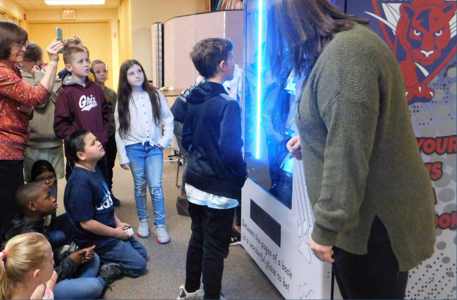
Mountain View students select books from Inchy the Bookworm Vending Machine .